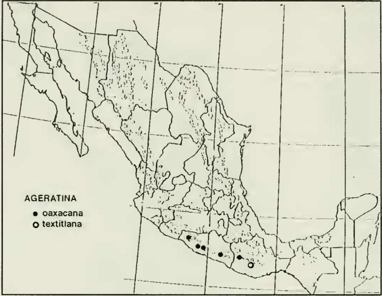
Fig. 8. Distribution of Ageratina oxacana and A. textitlana .